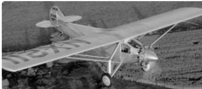
The Spirit of St Louis over the fields of Wisconsin.

The Spirit of St Louis will be available weekends at Pioneer Airport from June 1st onwards. Rides cost $100. As the airplane is occasionally away attending special events, you may wish to call ahead to check availability 920-426-4867.