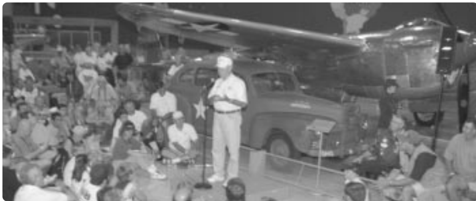
Chuck Yeager, the first man through the sound barrier, will be returning for the Speaker Showcase during AirVenture.

This is just the Museum's contribution to EAA's monster event, the world's largest fly-in convention and air show. You can always find out more at www.airventure.org